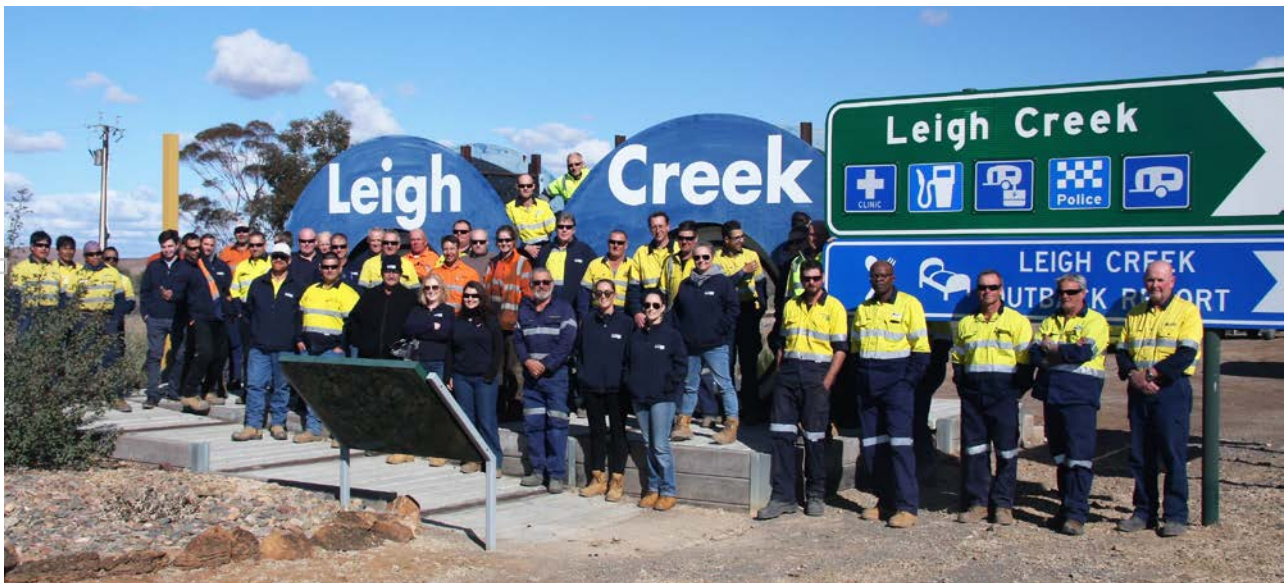
LCK Construction and Drilling personnel

With on-site construction and drilling activities complete, and receipt of the AN for Operations, the PCD is being prepared for operations and the production of syngas. At this stage, initiation and commencement of syngas is expected to commence within quarter 3 2018.