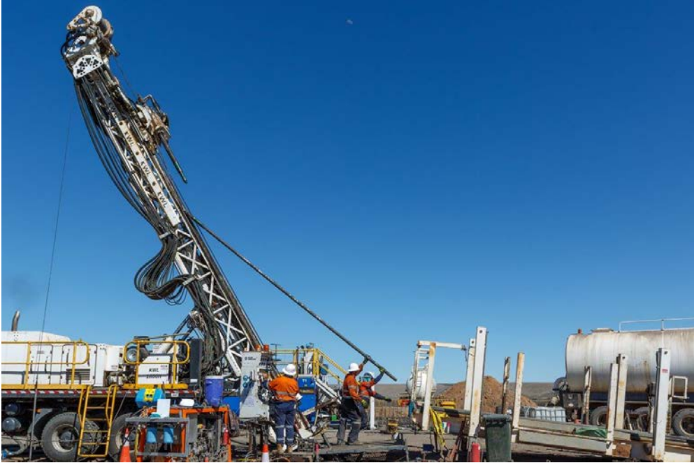
Drill rig on site at the LCEP

Information from the additional Drilling Program has enabled the Company to provide the Regulator with the required information. Significantly, LCK has reaffirmed that there are no significant geological structures in proximity to the intended PCD Gasifier location.