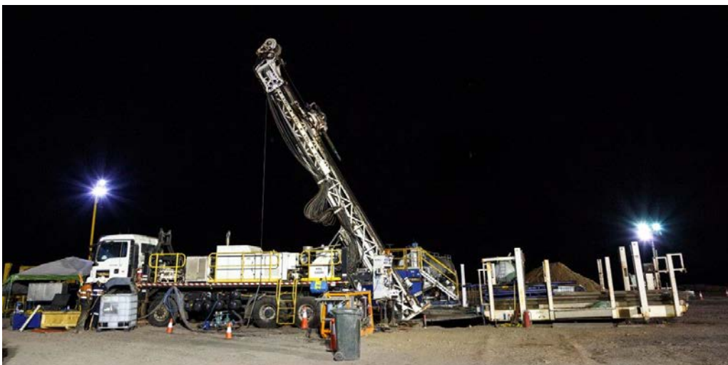
Exploration rig on site at the LCEP

Information from the additional Drilling Program has also enabled LCK to complete the EIR and companion document, the Statement of Environmental Objectives (SEO), constituting the approval documents for the LCEP PCD. These are the key documents required for assessment as part of the approval process for PCD operations in accordance with the requirements of the Petroleum and Geothermal Energy Act 2000 .