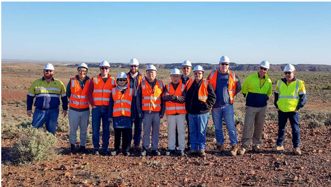
CNE and LCK personnel onsite at Leigh Creek