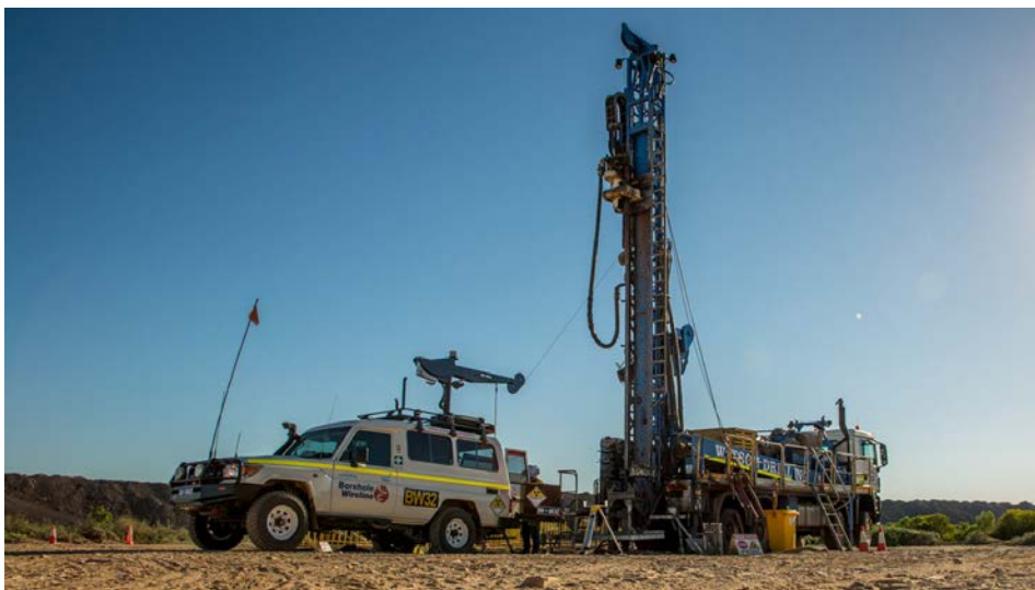
Drill Rig on site at the LCEP, May 2017

The ongoing work on environmental assessments and regulatory approvals continues. The program to complete drilling of groundwater and pressure baseline monitoring wells is nearing completion. Data from these wells will be analysed to complete the conceptual model for environmental baseline characterisation. Additional groundwater and pressure monitoring wells will be installed surrounding the selected PCD site.